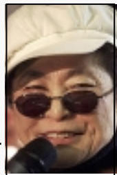
Yoko Ono 18.2.1933 Tokyo 1963