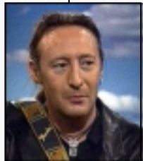
Julian Lennon 8.4.1963 Liverpool

(1) Cynthia Powell 1962-1968 10.9.39 Blackpool