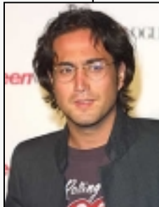
Sean Ono Taro 9.10.1975